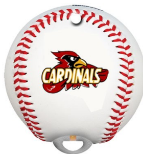
Baseball GELZEEZ TAGZ Item #: DAGT01-BB2012