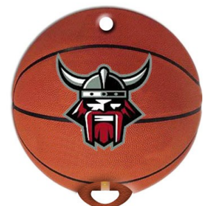
Basketball GELZEEZ TAGZ Item #: DAGT01-BKB2012