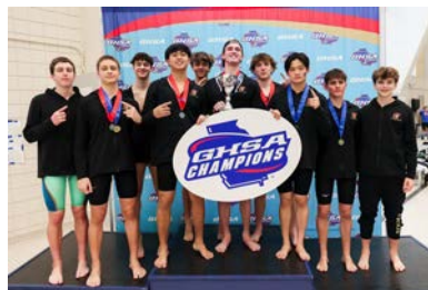
GAC (1-3A Boys)