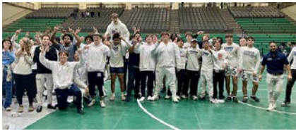
Class 6A - Camden