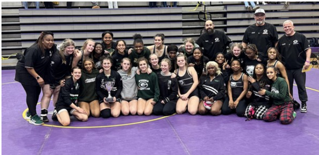
Girls Division 1 - Greenbrier