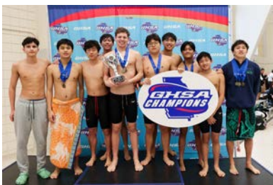
Northview (4A Boys)