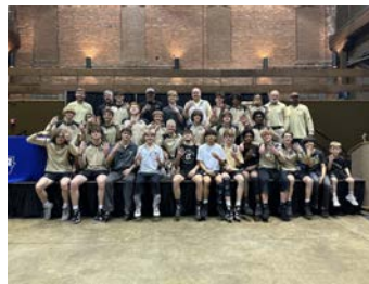
Class 2A - Rockmart