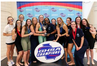
Lovett (1-3A Girls)

All action photography orders were made in advance with riveroakphotography.com , but you can sign up to be notified when awards podium photos by clicking here . Contact orders@riveroakphotography.com with any questions. Select photos will be placed on GHSA Photo Gallery .