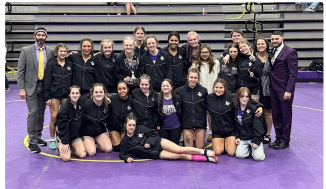
Girls Division 2 - Lumpkin County