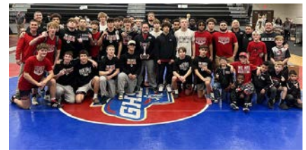
Class 1A - Social Circle