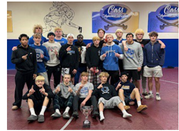
Class 4A - Cass