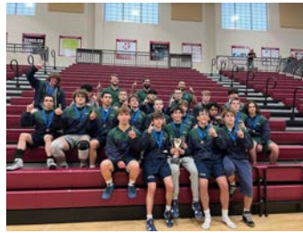
Class 5A - Creekview