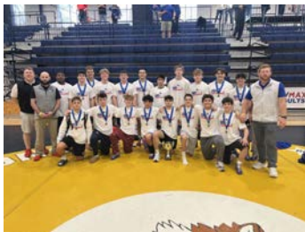
Class 3A - Jefferson