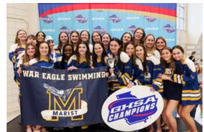
The Marist (4A Girls)