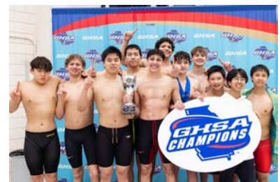
Johns Creek (5A Boys)