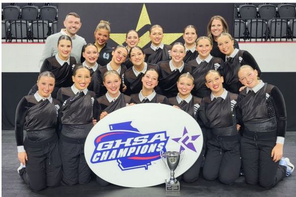
4A-5A Starrs Mill