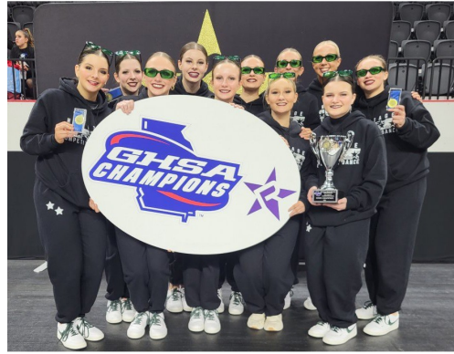
2A-3A Heritage Catoosa