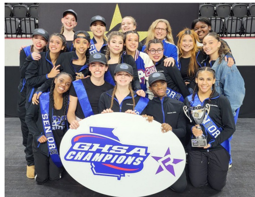
6A Peachtree Ridge