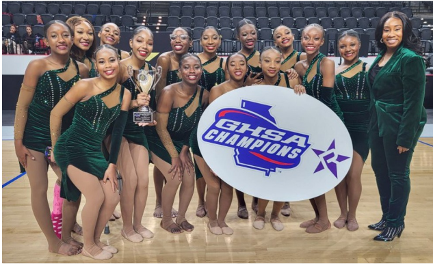
1A Stillwell Arts